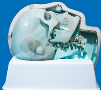
MR Distortion & Image Fusion Head Phantom