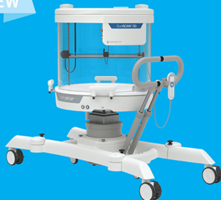
SunSCAN™ 3D Water Scanning System

Meet the stringent demands of stereotactic treatments, with our suite of SRS/SBRT solutions.